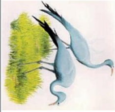
Bird - Blue Crane