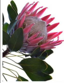
Flower - King Protea