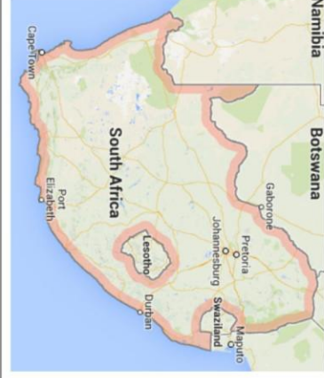
South Africa is at the Southern most point of Africa