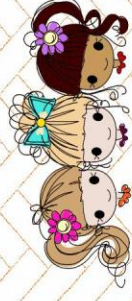
South African Girl Tourism