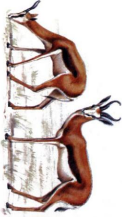
Animal - Springbuck