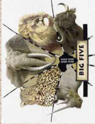
Rhino, Leopard, Elephant, Lion and Buffalo

These five animals are the most dangerous animals when wounded